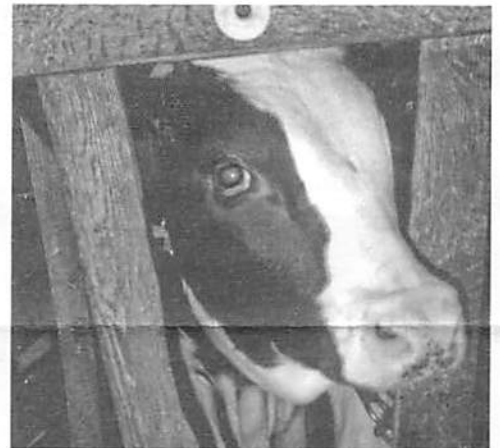
Calves are chained and suffering in crates right now.