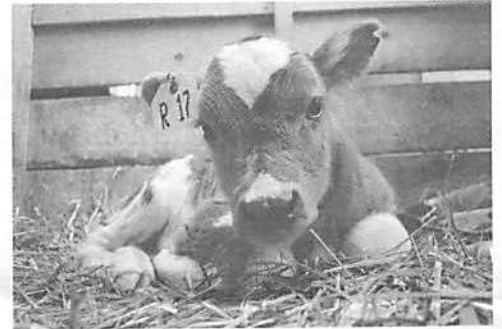
For over 35 years, Farm Sanctuary has been rescuing animals, like Blitzzen, from harsh environments, nursing them to health, and giving them new, better lives.

To help stop their suffering, we need to change the way business is done on America's factory farms, stockyards, and slaughterhouses. That's why I urge you to join Farm Sanctuary today to help: