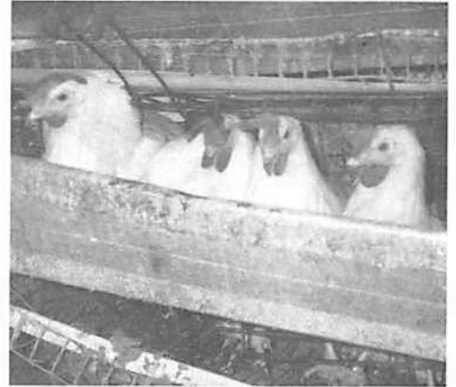
Symphony was finally rescued from cruel conditions after the battery cage she was confined in was decimated by a tornado.

...mothers like Julia will have their babies ripped away from them and sent to the slaughterhouse.